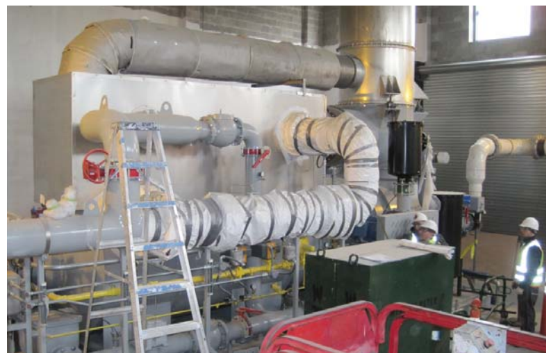
Engineers and contractors installed and finalized some of the connections of the Flame oxidizer unit—the principal treatment for the soil vapor extraction system.